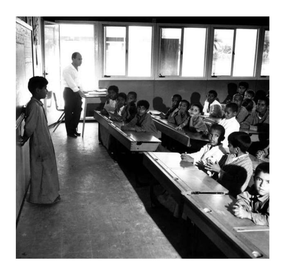
1966, Students of "The New School for Boys in Abu Dhabi" supported by the Egyptian Education program