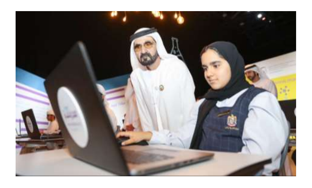
2012 , HH Sheikh Mohammed Bin Rashid Al Maktoum, Vice President and Prime Minister of the UAE and Ruler of Dubai, launch Smart learning Program in all UAE Schools