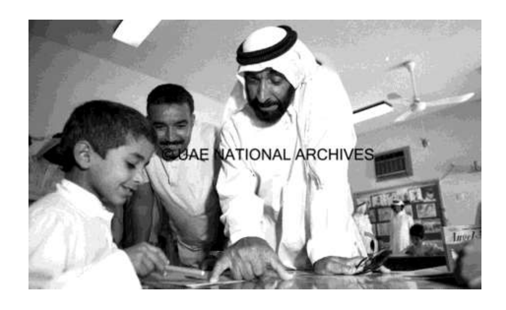
1972, the late HH Sheikh Zayed bin Sultan AlNahyan, the first President of the UAE during a school visit in Gahayathi